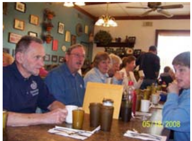
Waitin' for breakfast.

By the time you read this issue if our Signal Bridge our Annual Breakfast n' Bed will have been another "GREAT" fellowship event. I would like to thank all 18 people who could make it! The Parkway Restaurant is the Best and I look forward to next year So we can enjoy again.