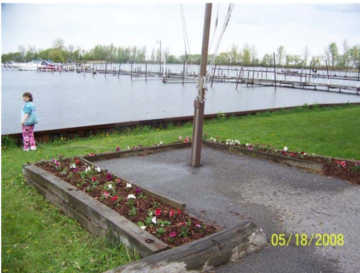
Flotilla 45 Memorial Garden. Rain, cold and gloomy weather can't stop the "CAN DO" Flotilla from getting the job done.