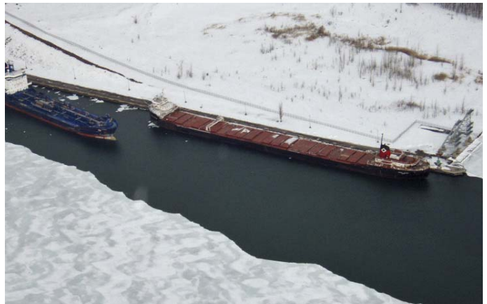
Two freighters positioning at the lock in Messina.

On the 27 th I flew a patrol to Messina and observed a lot of freighter activity on the St. Lawrence pre the opening date.